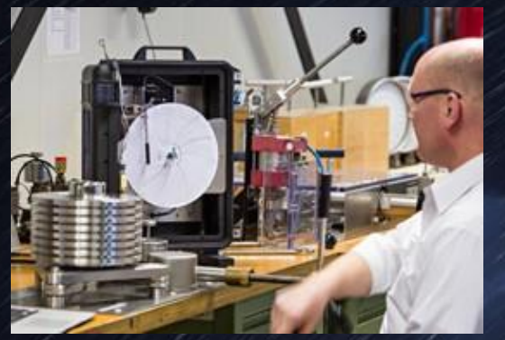
PRESSURE CALIBRATION 0-4000 bar (60.000 psi)

Stiko supplies to customers around the world mainly in the chemical, petrochemical, offshore, oil & gas, shipping, food & dairy and pharmaceutical industries. Due to our large stock of parts we are able to supply within 24 hours. Instrumentation according to customer specifications? No problem! Your wish is our command.