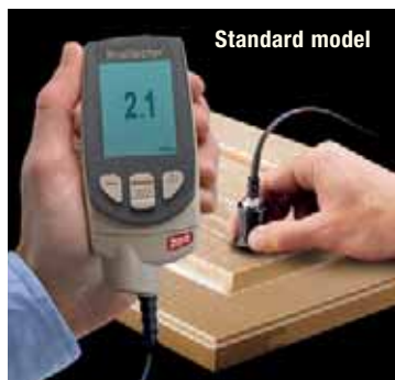
B Probe for measuring polymer coatings on wood, plastic, etc.