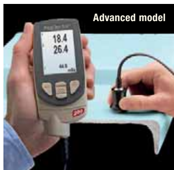
C Probe for measuring coatings on concrete, fiberglass, etc.