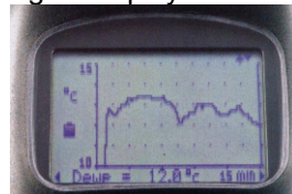
scrolling real time display