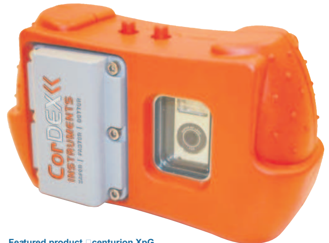
Featured product centurion XpG